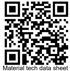
Material tech data sheet